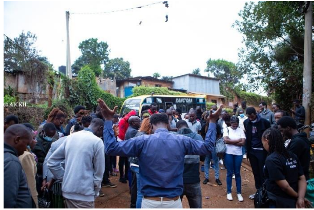
Beginning the day with prayer with the Kijabe hospital team

with Kijabe Hospital, which is Christian mission hospital. This was a long time in the planning but was delayed because of government bureaucracy. The hospital brought 70 members of staff, mostly junior doctors, and were able to screen 436 people, including 171 children. Some were sent straight to hospital, including some critically ill children. Others were referred to various clinics. A hospital chaplain came to meet with people and he gave Bibles to those who were interested. He reported that 16 people made decisions for Christ. Afterwards, the doctors all came to our garden for lunch, which was prepared by a team of ladies from church. We are planning another medical outreach to happen in December. May such endeavours point people to the great Saviour as we model His love in word and deed.