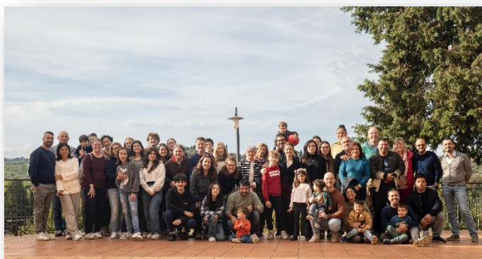
Church Weekend Away